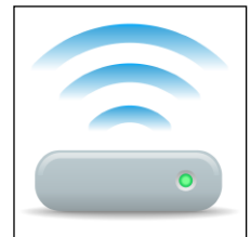
Super long range Bluetooth technology