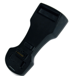
CONVENIENT CHARGING DOCK