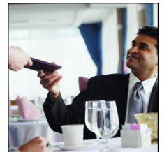
Ideal for Pay-at-the-table

Truly designed for maximum performance, the Optimum M4240 features new "Power-Amp" Bluetooth technology, providing the best connectivity over the greatest distance, even through barriers and obstacles that may exist at the merchant location. The reception and range of the M4240 Bluetooth solution is over double that of competitive models.