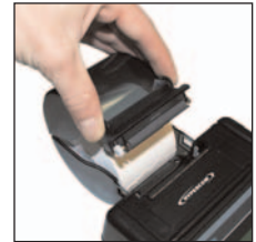
No-jam clamshell, integrated printer