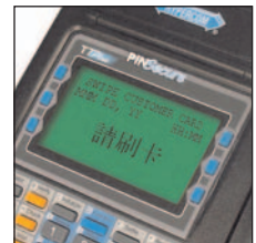
Customizable GUI display